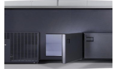
REFRIGERATED REAR STORAGE